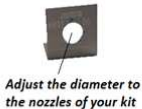
Flat angle bracket